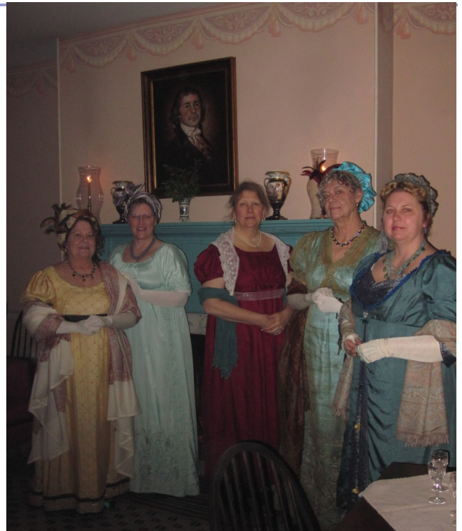
Above: Photo of the women who each have hand-made ball gowns for the Candlelight Tour. Below: Time-lapse photo of the kitchen during set-up for the Candlelight tour. Left, Top: volunteers dancing during the Candlelight tour. Left, Middle: Exterior of the Stephenson House decorated for the Candlelight Tour. Left, Bottom: Time-lapse photo of the dining room decorated for the Candlelight Tour.